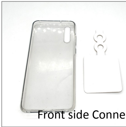
Front side Connector.