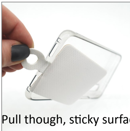
Pull though, sticky surface inwards.