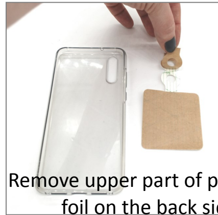
Remove upper part of protective foil on the back side.