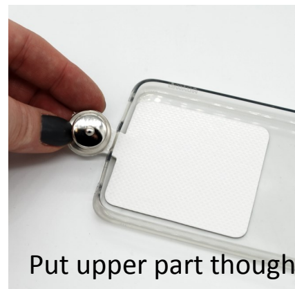
Put upper part though eyelet.